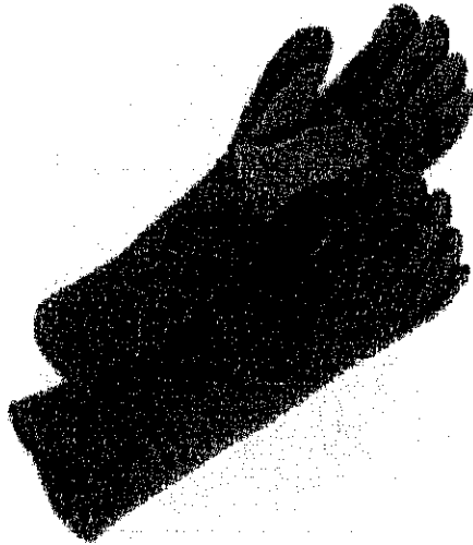
Figure 1: Welding Gloves