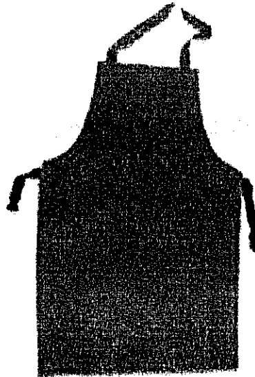
Figure 2: Welding Apron

Issued by: Head of Section, Tech Stds & Specs