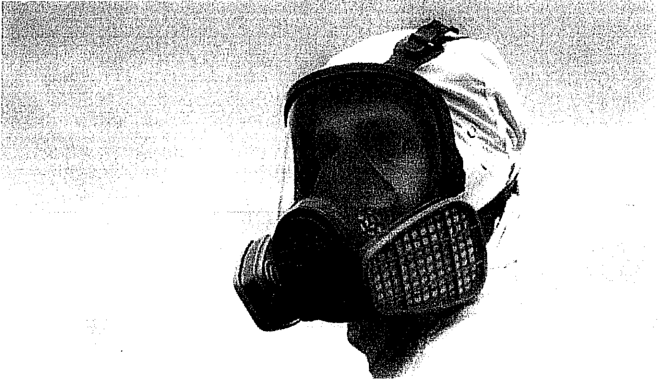
Figure 1: Design for Half Facepiece Respirator